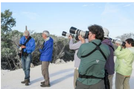
SMRA photographers focused on Cuba birds! Come to our Annual Dinner on Sunday, April 3 to see what we saw this February & March on our Cuba birding trips.