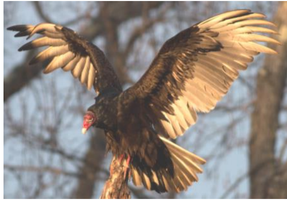
Turkey Vulture about to take flight.