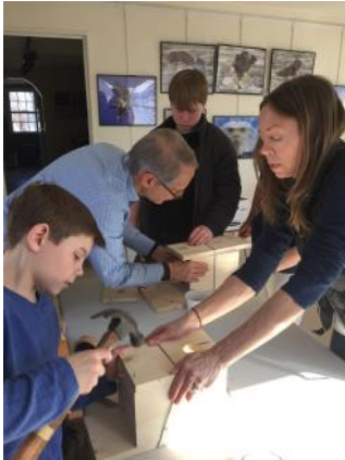
Building bird boxes at Croton Point Nature Center in February.