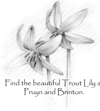
Find the beautiful Trout Lily at Prugn and Brinton.

You may also join, give a membership gift, create a special tribute gift or a memorial donation online!