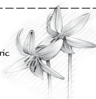
See the beautiful trout lily at Pruyn Sanctuary.

Visit one of our sanctuaries and explore nature. Your gift helps us to preserve and protect these special places close to home. You may also join, give a gift membership, or make a memorial donation online.