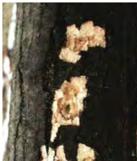
Woodpecker damage to an ash tree infested by the emerald ash borer

The US Department of Agriculture (USDA) is asking birders and others for help in alerting authorities to the presence of the EAB. Woodpeckers dig into infested trees to attack EAB larvae.