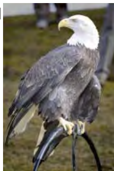
Liberty the bald eagle entertained and educated visitors to the 2012 EagleFest.

Saw Mill River Audubon was pleased to help support the 2012 Hudson River EagleFest on February 4th. Organized by Teatown Lake Reservation, this year's EagleFest attracted thousands of people to the eagle spotting and exhibit sites. SMRA sponsored and staffed three of the viewing locations. Our thanks to the many volunteers who helped us reach out to a broader public about bald eagles and other conservation issues.