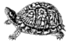
The eastern box turtle finds a home in our sanctuaries.

Visit one of Saw Mill River Audubon's sanctuaries and experience the natural world. Your gift helps us to preserve and protect these special places close to home.