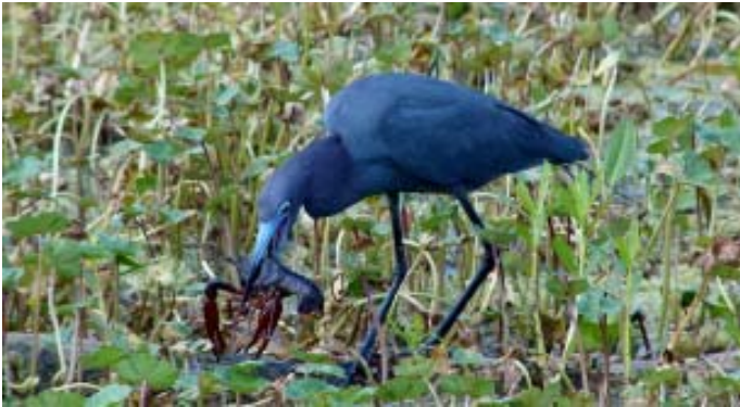
Little blue heron eating a crayfish at Brazos Bend Nature Center