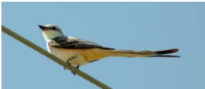
Scissor-tailed Flycatcher in Comfort, Texas