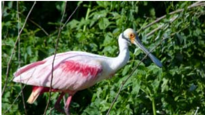
Roseate spoonbill at High Island