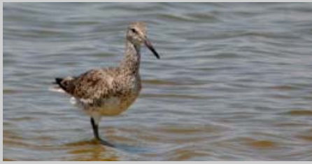
Christine McCluskey photographed this western willet at Crystal Beach on SMRA's birding trip to Texas in April. See more of Christine's photos from the Texas trip on page 3.