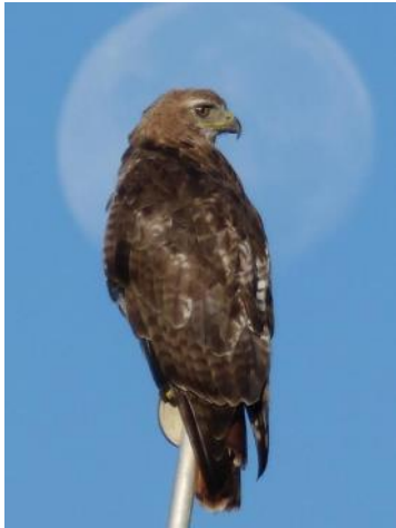
Red-tailed Hawk with the full "blue moon," July at Croton Point.