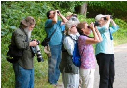
August birding at Rockefeller State Park Preserve