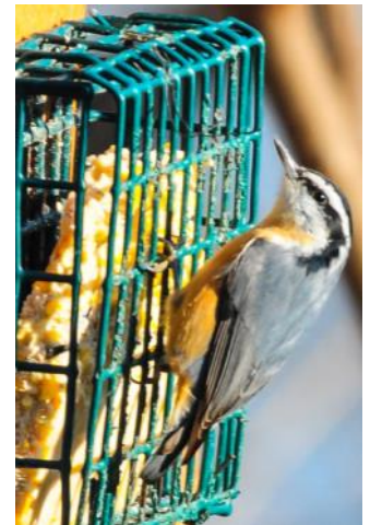
Red-breasted Nuthatch at Croton Point. Nature Center

Saturday & Sunday, November 14 & 15, 9:00 am–11:00 am Project FeederWatch Begins at Croton Point Nature Center. SMRA volunteers will be present every Sat & Sun through late April to identify & count birds at the feeders.