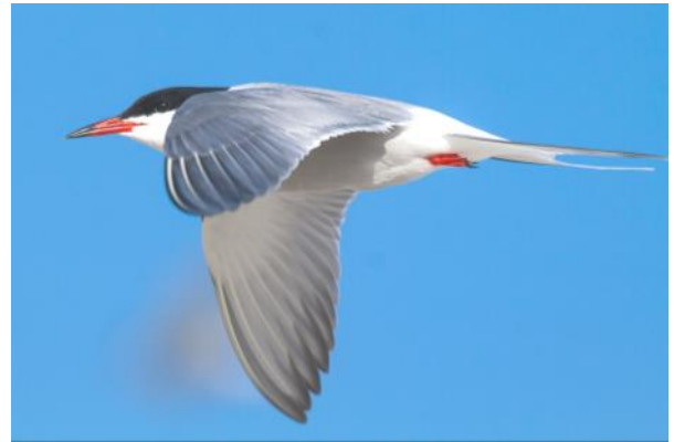
Common Tern on the wing.