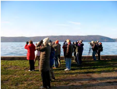
Birding along the Hudson River, Croton Point.