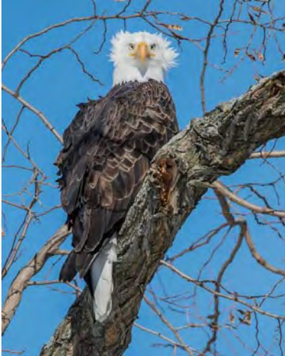
Bald Eagle.

PERIODICAL POSTAGE PAID at Chappaqua, NY and additional offices