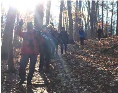
New Year's Day Hike at Rockwood Hall.