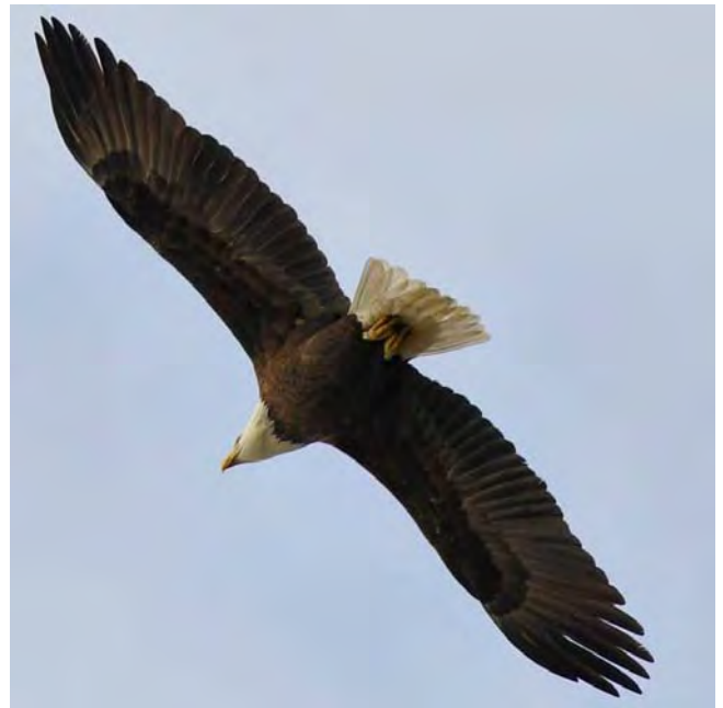
Bald Eagle.

There is an admission charge to enter Croton Point for the main event tent and other activities there. To find out more and make advance special event reservations, visit: www.teatown.org/eaglefest-schedule