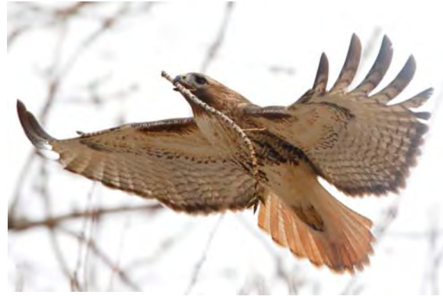
Red-tailed Hawk preparing nest, Croton Point Park, Winter, 2016.