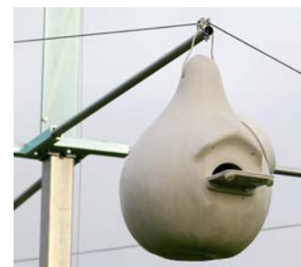
Purple Martin nesting structure at Croton Point Park.