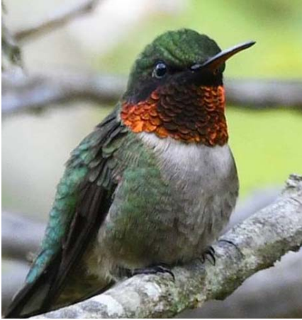
Ruby-throated Hummingbird at Pruy Garden.

PERIODICAL POSTAGE PAID at Chappaqua, NY and additional offices