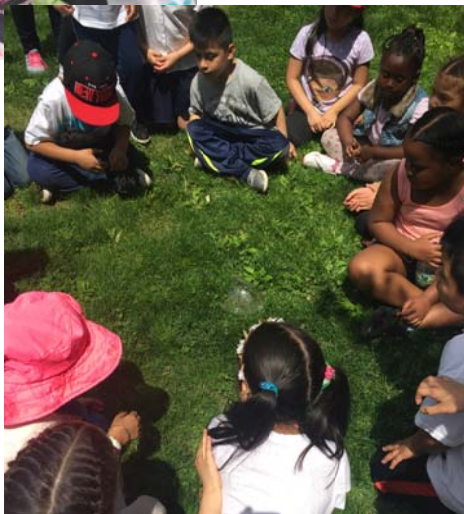
Yonkers 1st graders, Connect Kids to Parks SMRA field trip May 2017