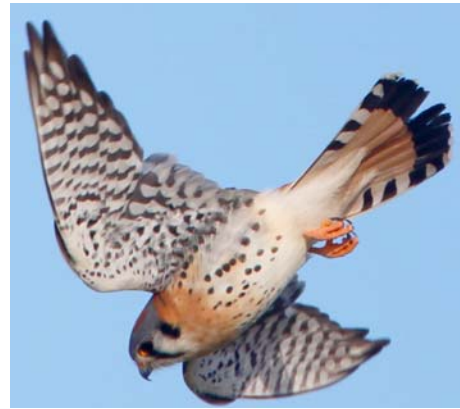
American Kestrel at Croton Point Park.