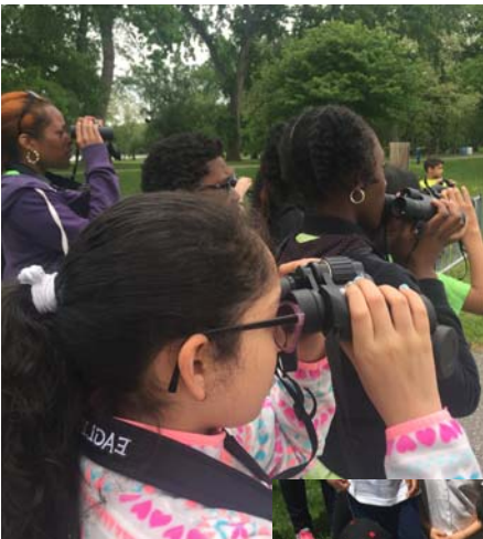
Bailey Elementary School White Plains Birding with SMRA at Croton Point, May 2017