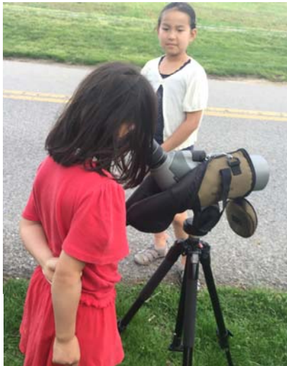
SMRA Young Birders Walk, April 2017