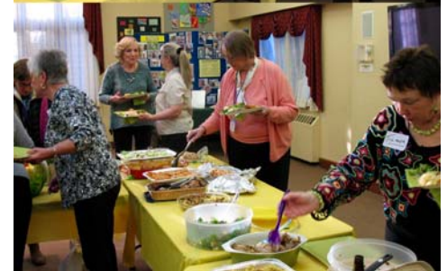
Our Welcome to Spring Potluck Supper filled the New Castle Community Center on April 2nd with a fun evening celebrating SMRA.