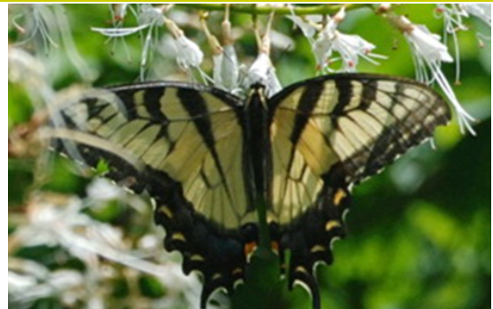
Tiger Swallowtail.