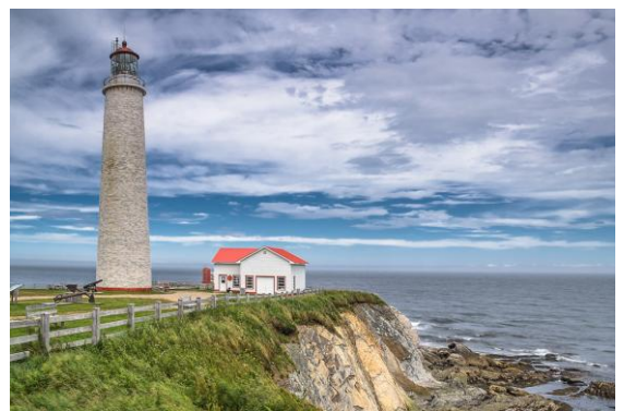
Cap-des-Rosiers Lighthouse.

Thursday, June 4. Around the top of Gaspé Peninsula to the town of Gaspé. Today we will bird around the northern part of Gaspé Peninsula with coastline birding stops for seabirds, scoters, Harlequin ducks and seal views. We plan to visit Forillon National Park at the easternmost tip of the peninsula with the Cap-des-Rosiers Lighthouse. (And, along the way, enjoy the best chocolate-dipped ice cream!) At the lighthouse, we will be scanning for Black-legged Kittiwakes that nest here and other seabirds such as Black Guillemots, Razorbills and Double-crested Cormorants. All are attracted to the surrounding waters, rich in food, that also draw in whales, porpoises, dolphins, and seals. Overnight at Hôtel Baker, Gaspé. (B, L, D)