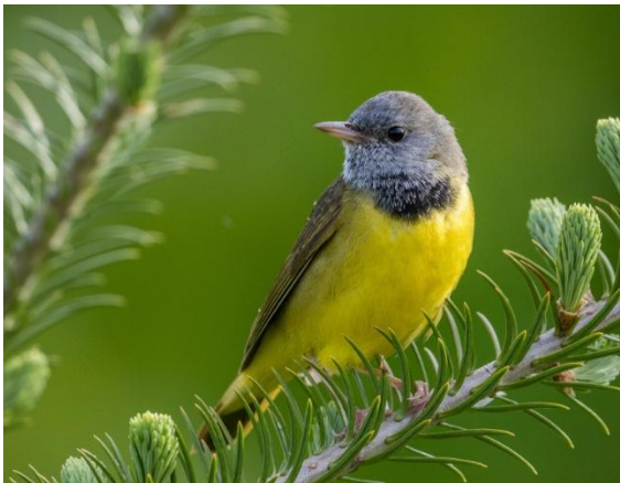
Mourning Warbler.

Tuesday, June 2. New York to St Antoine de l'isle aux Grues. We expect to depart from Pruyn Sanctuary by 6:30 am. This will be our longest driving segment of the trip (9 hours plus lunch stop and restroom and birding stops) as we go north through Vermont and into Canada continuing up along the St. Lawrence River about 35 miles north of Quebec. Then we'll take a car ferry at Montmagny across to St Antoine de l'isle aux Grues, an island in the middle of the St. Lawrence River. We'll be birding late afternoon and early morning in the special habitats of this Island and along the river shoreline. In addition to river waterfowl, we expect marsh and meadow birds including Nelson's Sparrow, Bobolink, Marsh Wren and various warblers. Short-eared Owls and Wilson's Snipe breed here. We will also be listening hard for the rare Yellow rail—as Charlie says, "Maybe a wild dream." Overnight at Les Maisons du Grand Heron on St Antoine de l'isle aux Grues. (D)