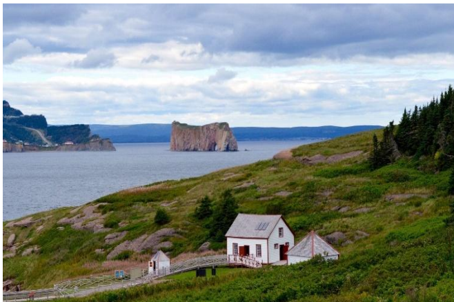
View from Bonaventure Island back to mainland.

We certainly expect to see Northern Gannet since thousands do nest here! Other birds include Black-legged Kittiwakes, Common Murres, Razorbills, and perhaps Bald Eagle or Merlin. Good opportunities on the island for bird and wildflower photography, and some optional longer hiking.