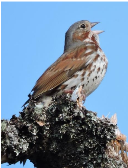
Singing Fox Sparrow.

Today's travel day across the middle of the Gaspé Peninsula will allow us to revisit some spots for birds we missed seeing or photographing and visit some new birding hotspots as we return to the St. Lawrence River at Nicolet and Trois-Rivières. Our final lodging will be in the historic city of Trois-Rivières which is just across the St. Lawrence River from key birding spots in the Nicolet area. Our hotel for the next two nights will be in the charming and historic L'Auberge Du Lac St-Pierre on the edge of the St. Lawrence River with an excellent restaurant on the grounds as well. There are spa options here including a sauna and massage service so feel free to relax here instead of being on some of our side birding jaunts or spa after birding! Overnights (Tue and Wed) at L'Auberge Du Lac St-Pierre. (B, L, D)