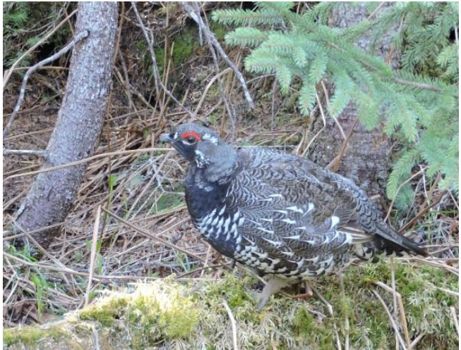
Spruce Grouse.

Gaspésie National Park. Next we will explore the key habitats and birding spots of Gaspésie National Park. Because of the extreme climatic differences between the valleys and the high peaks found in this region, there is a diversity of northern birds to be found. Boreal birds such as Black-backed Woodpecker, Gray Jay and Spruce Grouse all possible as well as expected view of Evening Grosbeaks and Pine Siskins right around our lodgings and Moose visits!.