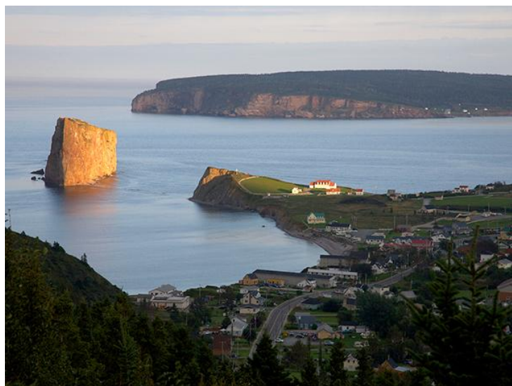
Percé Rock and Bonaventure Island in the distance.

Join Saw Mill River Audubon on a special expedition to the southeastern corner of Quebec to explore the stunningly beautiful Gaspé Peninsula. The peninsula is known for its great birding with a combination of seabirds, waterfowl, shorebirds, and boreal birds, and habitats varying from sea cliffs and marshes to boreal forests and tundra. We will visit key national parks including Gaspésie, Bonaventure and Percé-Rock as well as active birding hotspots. Our birding leaders for this trip will be Charlie Roberto and Anne Swaim.