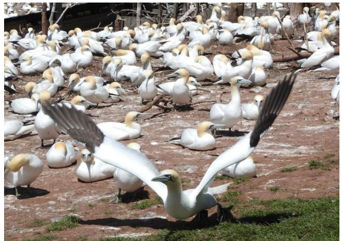
Northern Gannets.

Sat or Sun, June 6 or 7. Bonaventure Island. We will time our boat trip to the world-famous seabird colony on Bonaventure Island depending on the wind and weather. We will view the island from the boat and then land for time to explore the boreal habitats and open areas on the island with beautiful wildflowers, a gorgeous look back at the mainland, as well as cliffs overlooking the gannet colony.