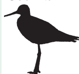
"Tringines" (genus Tringa, Stilt & Solitary Sandpipers, Willet)