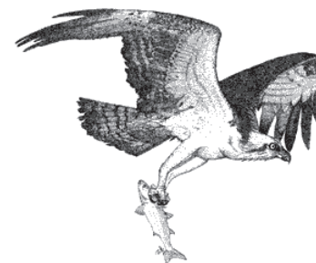
Ospreys are seen in the fall on the Croton River near Van Cortlandt Manor