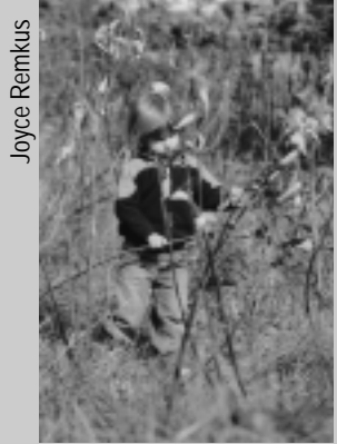
Exploring the meadow at Pruyn