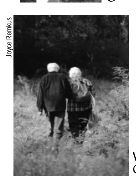
Birding at Brinton October 14