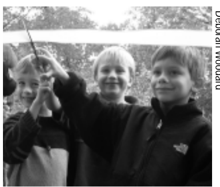
Ribbon Cutting Moment

On Sunday, October 22, Audubon members and friends gathered to celebrate Pruyn Sanctuary. More than one hundred visitors enjoyed: close looks at birds of prey, guided sanctuary walks, a children's nature hunt, music and refreshments, and a ribbon cutting for the new interpretive trail signs and kiosks. [More pictures on page 4.]