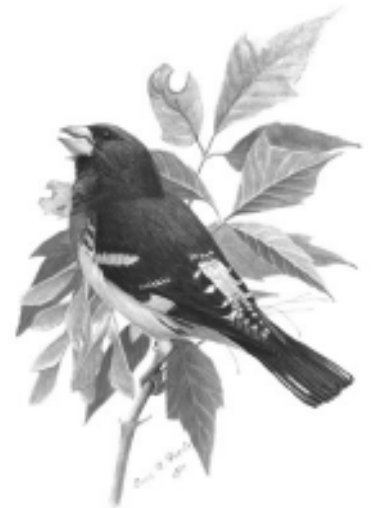
Rose-breasted Grosbeaks visit feeders in spring and summer in our area

Saw Mill River Audubon is now offering 20% off the cost of our remaining inventory of bird seed. To buy seed, please contact our office at 914.666.6503 and arrange to pick up your seed during regular office hours M/W/F 10:30 a.m. to 3:30 p.m. Remaining seed inventory includes: 25lb bags of both striped and black oil sunflower, both 4lb and 20lb bags of thistle and 15lb bags of peanut kernels.