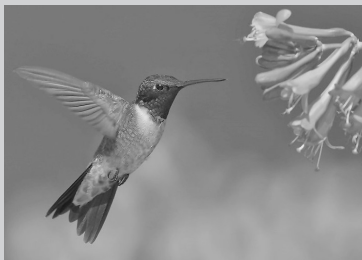
See ruby-throated hummingbirds at Pruyn Sanctuary this summer.

Summer Bird Seed Clearance Prices Save 20% on All Varieties of Seed