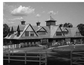
Kimberlin Nature Center