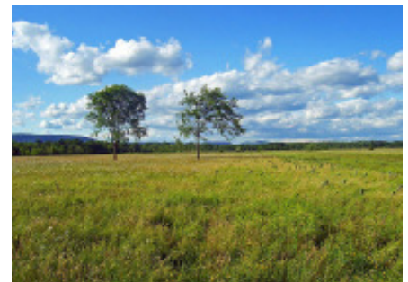
Expansive grassland habitat at Shawangunk Natl Wildlife Refuge

Saturday, May 21 ♦ 6:00 am Departing from Millwood A&P Sterling Forest Birding Sterling Forest State Park comprises over 21,000 acres of pristine natural refuge. Both blue and golden-winged warblers and other spring migrants are likely. Call or email to register.