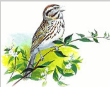
The song sparrow welcomes spring. Visit sawmillriveraudubon.org/singers to find out who is singing now!