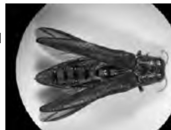
Adult emerald ash borer

Our woodlands and neighborhoods are being threatened by the spread of an invasive insect from Asia, the emerald ash borer (EAB). This beetle has been spreading across New York State. While there have been no sightings of this pest in Westchester, as a recent article in The Journal News points out, it’s only a matter of time—the EAB has been found on the grounds of the nearby U.S. Military Academy at West Point.