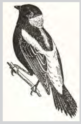
Ground nesting birds like the bobolink pictured above are suffering from habitat loss and other stresses in our region. See page 3 for more information about how to help these birds.