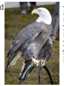
Liberty the bald eagle entertained and educated visitors to the 2012 EagleFest.

Saw Mill River Audubon was pleased to help support the 2012 Hudson River EagleFest on February 4th. Organized by Teatown Lake Reservation, this year's EagleFest attracted thousands of people to the eagle spotting and exhibit sites. SMRA sponsored and staffed three of the viewing locations. Our thanks to the many volunteers who helped us reach out to a broader public about bald eagles and other conservation issues.