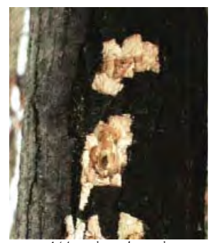
Woodpecker damage to an ash tree infested by the emerald ash infested trees to attack borer

Woodpecker holes (see photo above) are larger and easier to see than the D-shaped exit holes left by the EAB. Several infestations have been discovered because birders noticed woodpecker damage on ash trees.