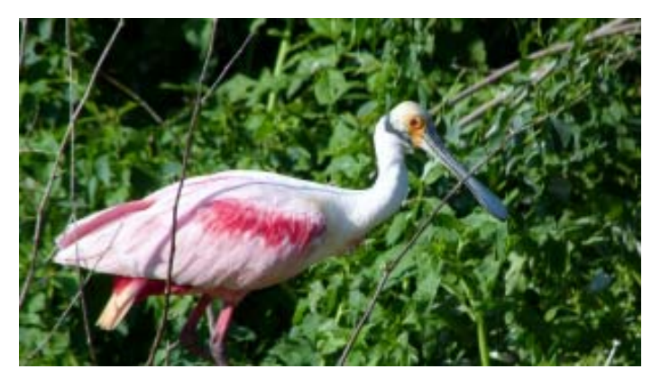
Roseate spoonbill at High Island