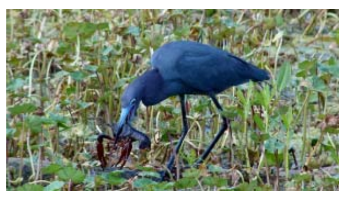
Little blue heron eating a crayfish at Brazos Bend Nature Center