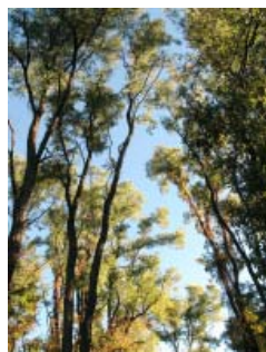
Black locust grove at Brinton Brook

Good for ages 6 and up. No pre-registration necessary. Held regardless of weather except in cases of severe weather or road closures. Meet at main parking area off Route 9A.