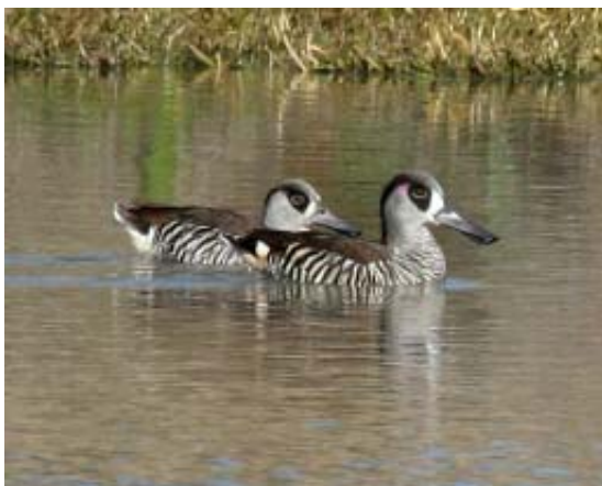
The pink-eared duck, a native of Australia, is on exhibit at the Tisch Children's Zoo in the Central Park Zoo.

Did you know that the Central Park Zoo is home to more sea ducks (by numbers and species count) than any zoo in the world? Overall, the zoo's collection boasts 23 duck species, some of which are rare or threatened in the wild. A captive breeding program for ducks at the Central Park zoo has been very effective and is helping inform conservationists about how ducks breed. For more information and to plan your visit, go to: www.centralparkzoo.com