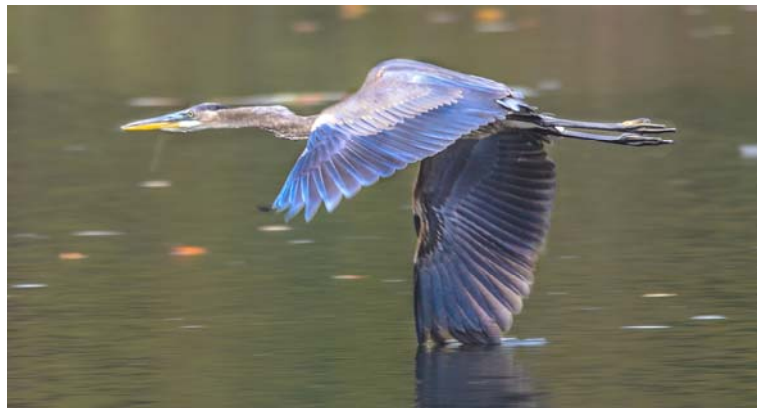
Great Blue Heron on the wing.