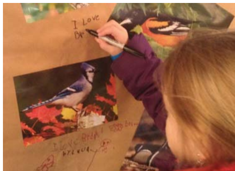
Visitor to our "Celebrate New York Birds" board during the 2015 Teatown Hudson River EagleFest