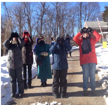
Hardy birders at Croton Point in late February viewing eagles and more in single digit temps!