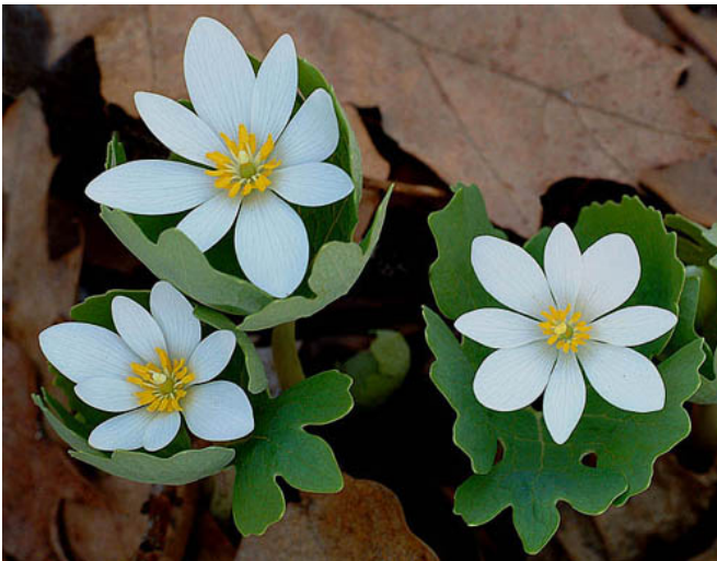
Bloodroot blooming on the spring forest floor.