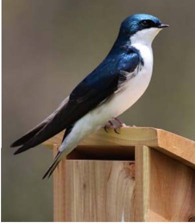
Tree Swallows and Eastern Bluebirds are looking for nesting cavities now. Consider adding a bird box!