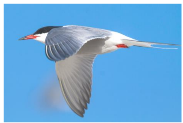
Common Tern on the wing.