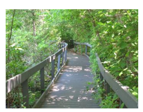
Pinecliff Sanctuary's wheelchair-accessible boardwalk