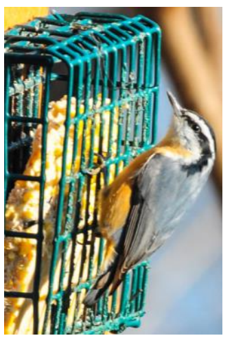
Red-breasted Nuthatch at Croton Point. Nature Center

SMRA volunteers will be present every Sat & Sun through late April to identify & count birds at the feeders.