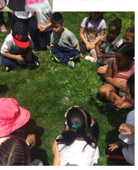
Yonkers 1st graders, Connect Kids to Parks SMRA field trip May 2017