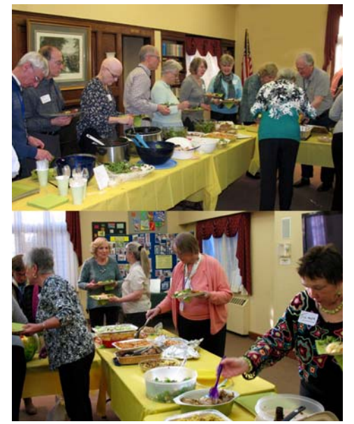
Our Welcome to Spring Potluck Supper filled the New Castle Community Center on April 2nd with a fun evening celebrating SMRA.