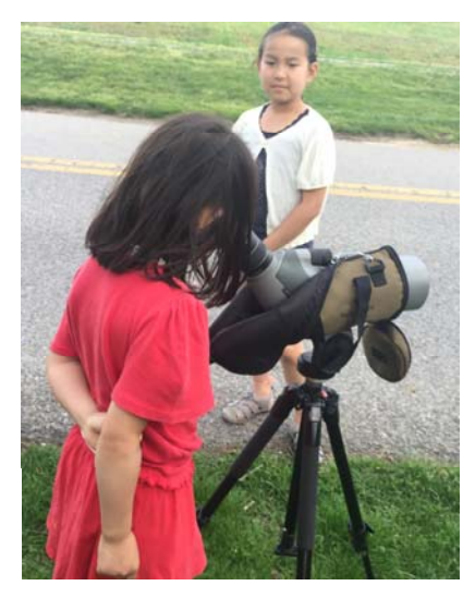
SMRA Young Birders Walk, April 2017

American Kestrel at Croton Point Park.