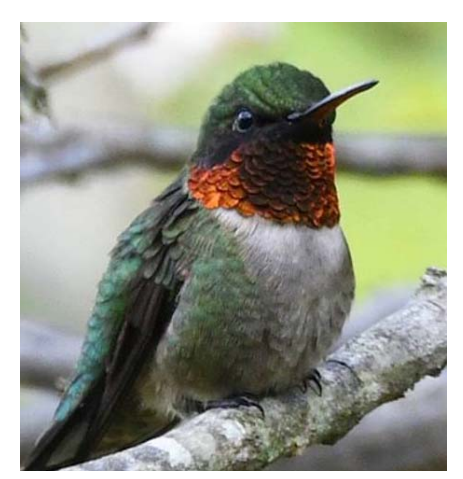
Ruby-throated Hummingbird at Pruyn Garden.