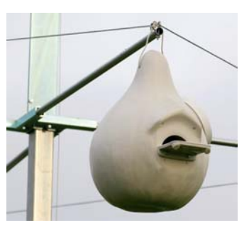
Purple Martin nesting structure at Croton Point Park.