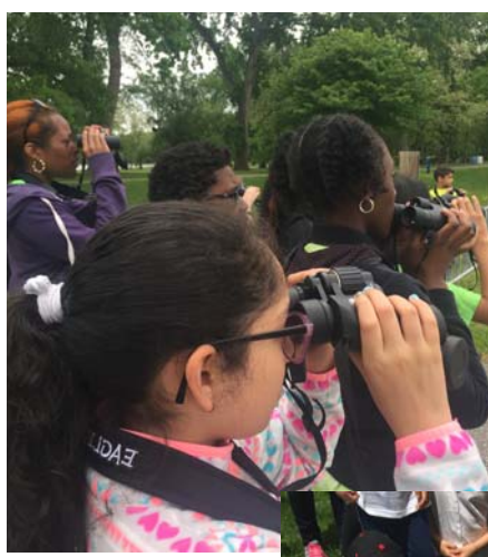
Bailey Elementary School White Plains Birding with SMRA at Croton Point, May 2017