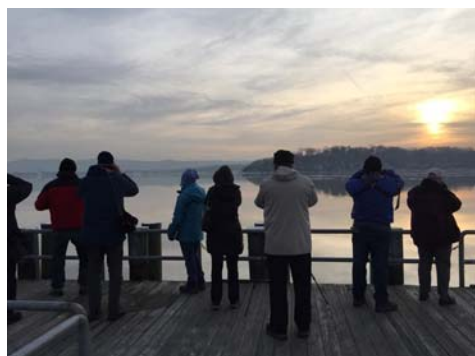
Eagle watching on the Hudson River. Bald Eagle roost monitoring in Verplanck at dusk.