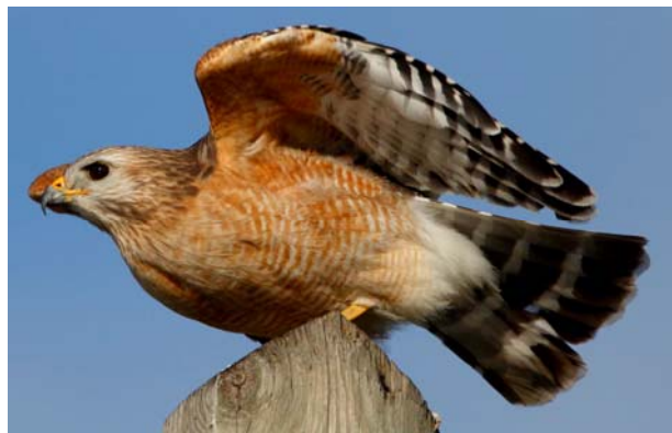
Red-Shouldered Hawk.