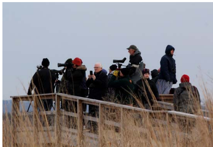
Watching Short-eared Owls at Shawangunk Grasslands National Wildlife Refuge in February.

ON THE WING, Saw Mill River Audubon's newsletter, is published four (4) times a year (Fall, Winter, Spring and Summer) for $7.50 a year by Saw Mill River Audubon, 275 Millwood Road, Chappaqua, NY 10514. Periodical Postage #013281 at Chappaqua, NY 10514. ISSN: 1545-5254 at Chappaqua, NY and additional mailing offices. POSTMASTER: Address changes sent to Saw Mill River Audubon, 275 Millwood Road, Chappaqua, NY 10514