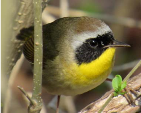
Common Yellowthroat.

PERIODICAL POSTAGE PAID at Chappaqua, NY and additional offices