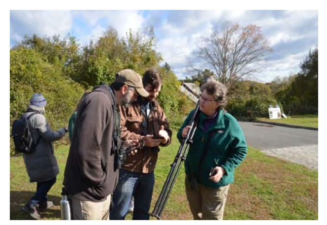
Trying out eBird in the field. See story to right.

Plum Island lies in Gardiner's Bay off Orient Point, Long Island. It has long been the site of biological research on farm animal pathogens and, based on limited human use, has served as a unique sanctuary for sea and shore birds, many of which are vulnerable species. The government plans to relocate this facility and may sell the island (or parts of it) to developers, including those who plan to build golf courses and related waterfront residences. Audubon is tracking this and will fight to preserve the island as a valued habitat for terns, and shorebirds including Piping Plovers.