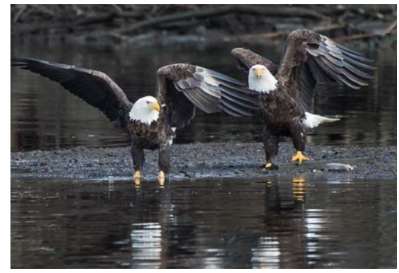
Bald Eagles on the Hudson. Come to Teatown's 2019 Eagle Fest! See details on page 3.