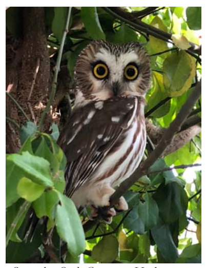
Saw-whet Owl. Croton-on-Hudson, 11/15/18.