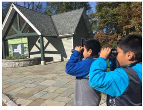
Saw Mill River Audubon led field trips this fall at Rockefeller State Park Preserve for all 18 fifth grade classes at Ossining's Roosevelt School. We are now planning to visit the students in their classrooms this winter!. Read more on page 4.

Join us for this fun and informal event where members and friends of Saw Mill River Audubon share photographic highlights of the past year of birding and natural exploration, and enjoy holiday desserts. If you would like to share 3-5 of your best photographs, email our office by December 10. Bring holiday cookies and other treats to share and exchange. (Okay to come without!)