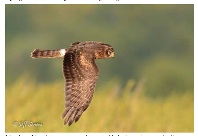
Northern Harriers are among the many birds that rely upon the Croton Point Park landfill grasslands as a migration stopover. SMRA is closely monitoring plans to improve the grasslands habitat.