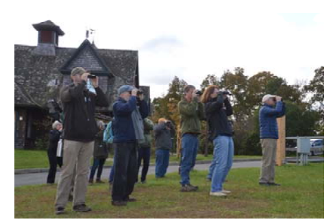
Birding at the Greenwich Audubon Center during the eBird conservation workshop led by SMRA for the H2H Regional Conservation Partnership. Read more on page 5.