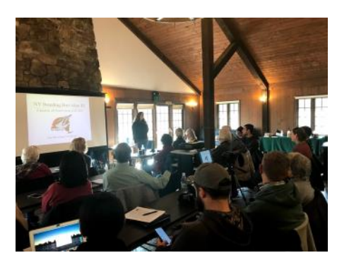
Lower Hudson birders gathered in early November at a workshop co-sponsored by SMRA and Putnam Highlands Audubon to prepare for the Third NYS Breeding Bird Atlas which begins January 2020. See article on page 4.

Visit our Google calendar at www.sawmillriveraudubon.org/calendar for more events, event details, and any schedule changes. Be sure to subscribe to our free, private email list to get additional details and early notice of new trips and events, including "pop-up" trips that we may add a few days before the trip. Visit www.sawmillriveraudubon.org/list to subscribe.