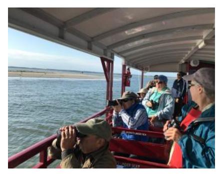
Participants on our fall Coastal Birding Trip explored coastal habitats in Delaware, Virginia, and New Jersey.