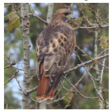
Perched Red-tailed Hawk at Croton Point seen on our recurring 4th Monday bird walk there in September.

275 Millwood Road Chappaqua, New York 10514 Return Service Requested